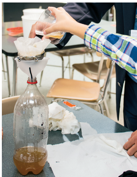
A parent and student engage in the "Clean Water: How Can You Make a Difference?" session. Participants conducted an experiment that explored the effects of pollution on a water supply.

Hundreds of students, family members, and CCSD21 friends engaged in the learning activities and got a peek into a student's life in District 21.