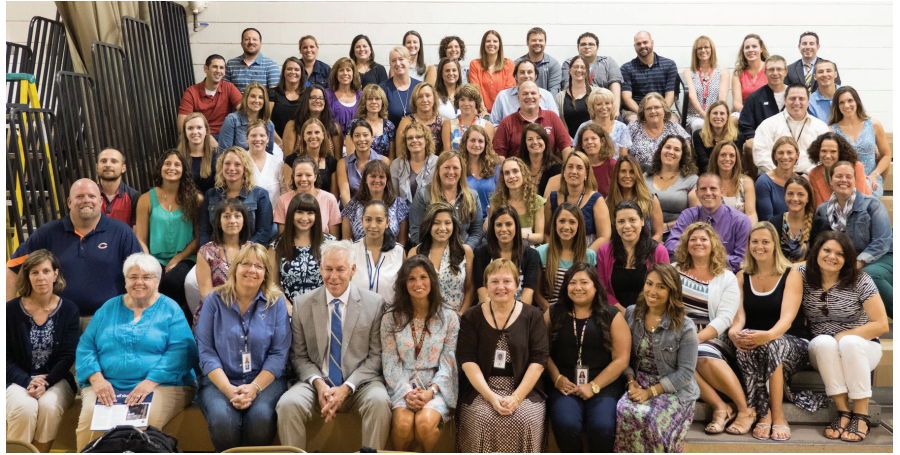
More than 75 alumni of School District 21 now serve students, families, and the community as teachers and staff.

We are proud to have more than 75 alumni, some who were enrolled as far back as 1963, playing a critical role in our schools. Our staff inspires the students of today to embody the curiosity, passion, and character, which were instilled within them when they were students.