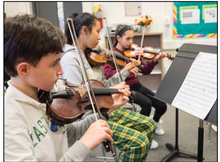
Who we are: CCSD21 serves 6,500 students across 13 schools, including one early childhood, nine elementary, and three middle schools.

Through phone and online surveys, 59% of CCSD21 voters identified they would support a $69 million bond issue.