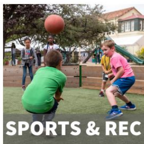
SPORTS & REC