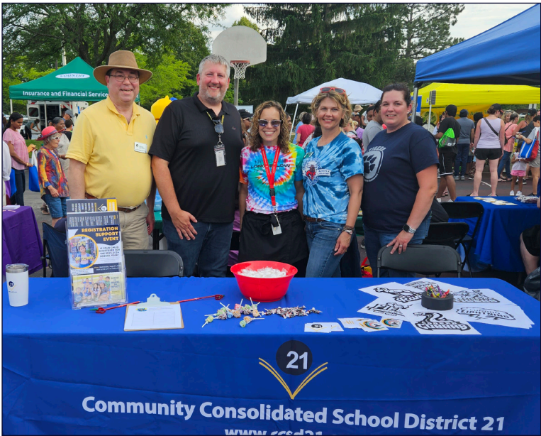
Night Out events.

We also attended a number of outreach events, including the Buffalo Grove Days Parade, Wheeling's Tuesday Night Market and International Festival, and three National